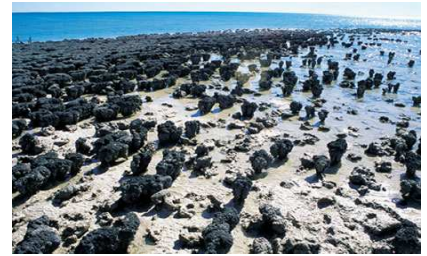
Hamelin Pool Stromatolites

Old Pearler Restaurant - is the only restaurant in the world built entirely from coquina shell carved from Shell Beach. Fresh local seafood is a specialty, with crabs and crayfish in season. Limited tables, must make advance reservations. 71 Knight Terrace, Denham WA6537. Tel: (08) 9948 1373